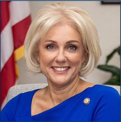
Jennifer Homendy Chairman