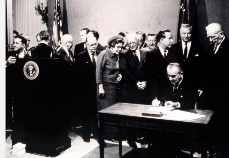
President Johnson signs the Department of Transportation Act of 1966 that created the NTSB.